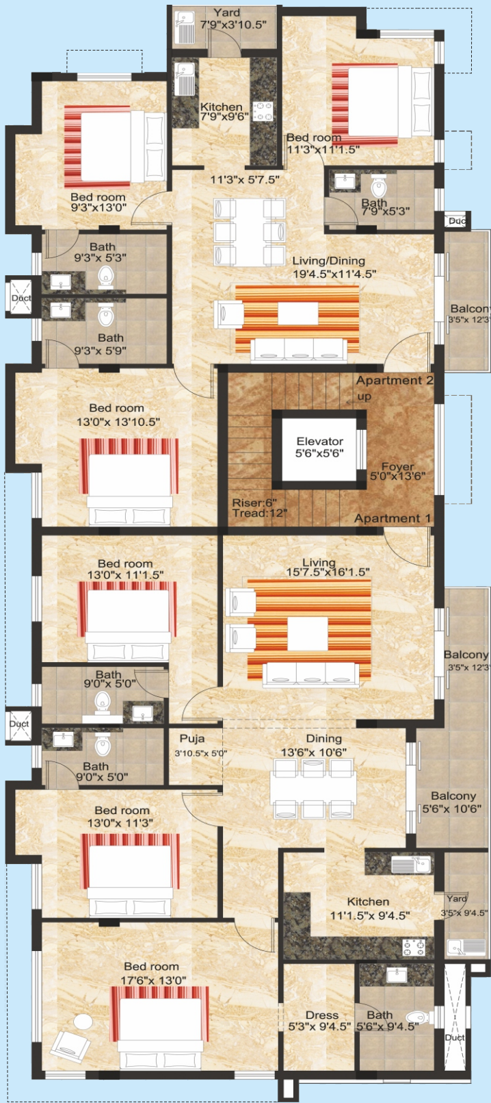
Apartment 102 : 1412 Sq.ft