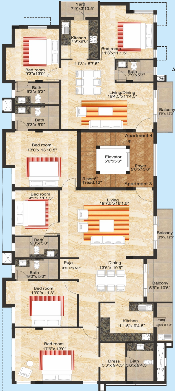
Apartment 202 : 1067 Sq.ft